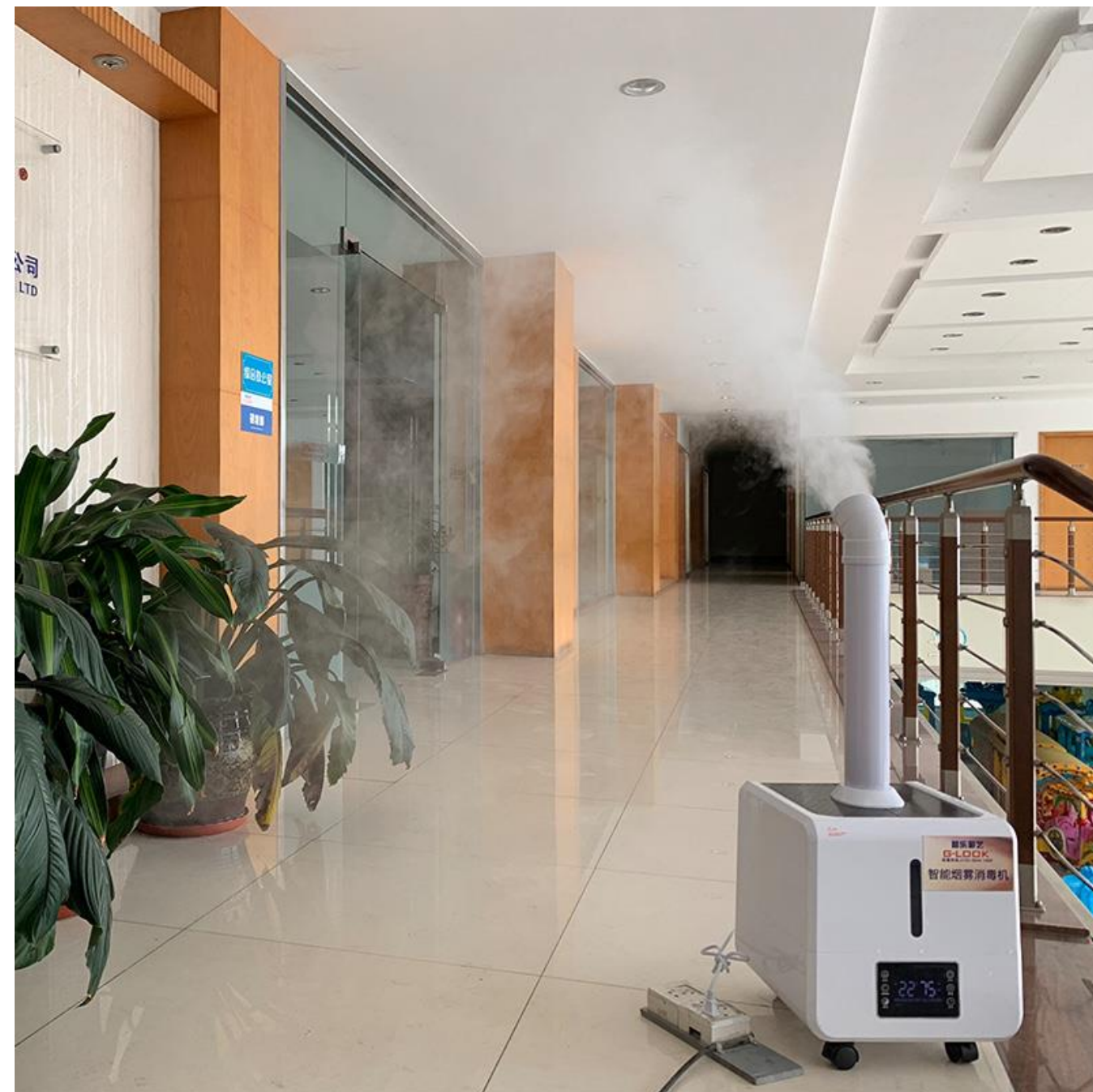
Mobile Air Filtration