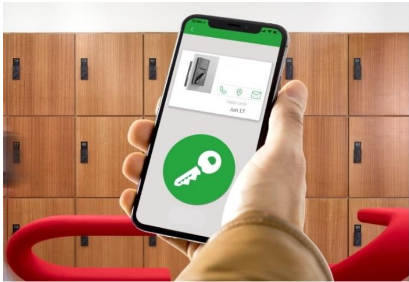
Keyless Personal Lockers