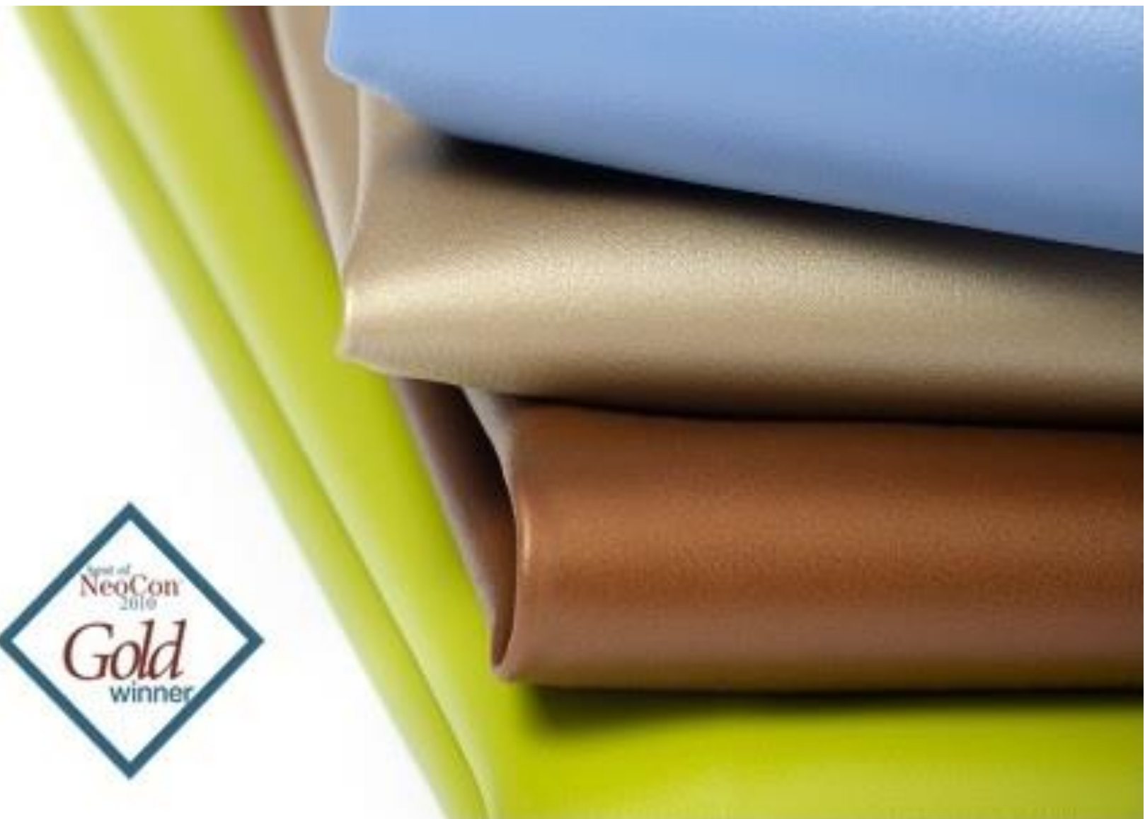
Silica Coated Fabrics