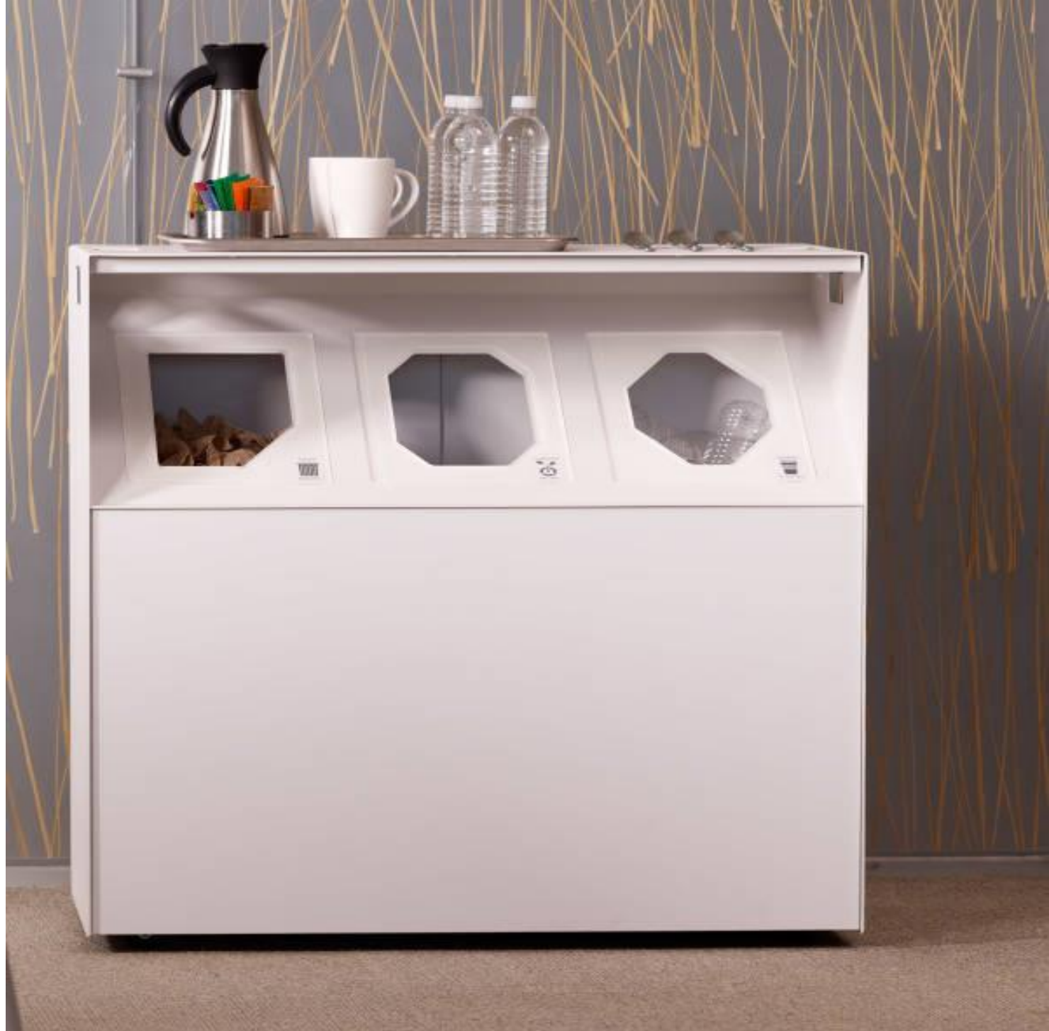
Open Receptacle Waste Bins