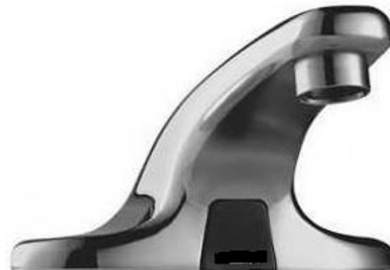
Automatic Plumbing Fixtures