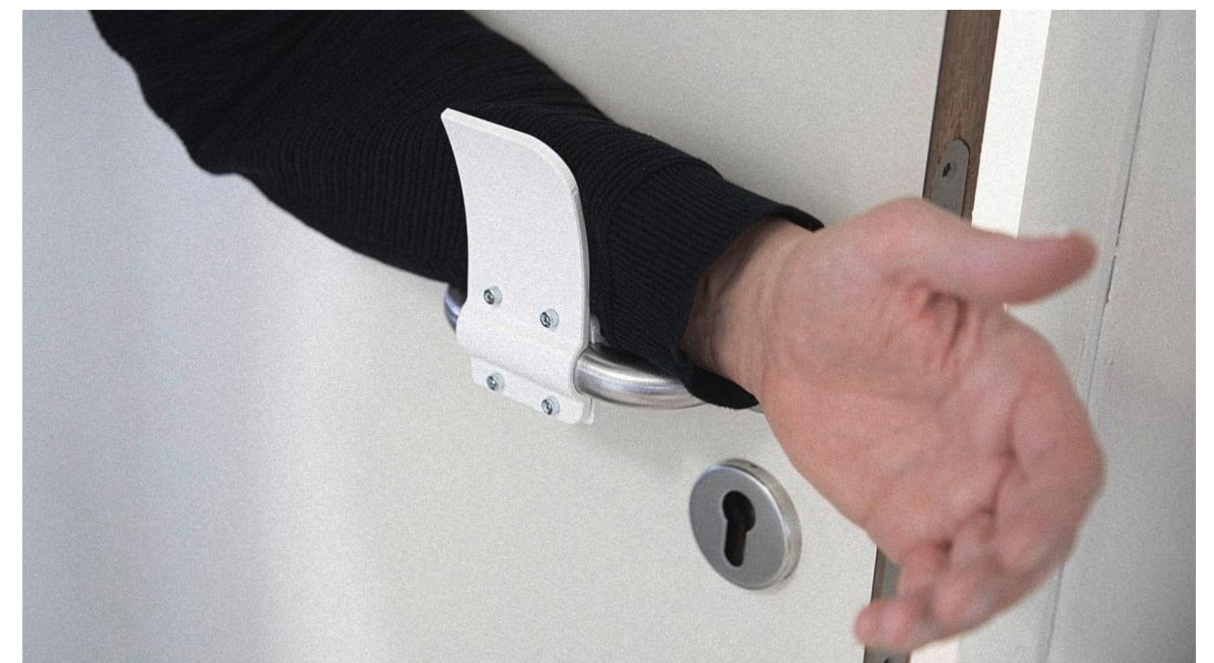
Wrist Grab Hardware