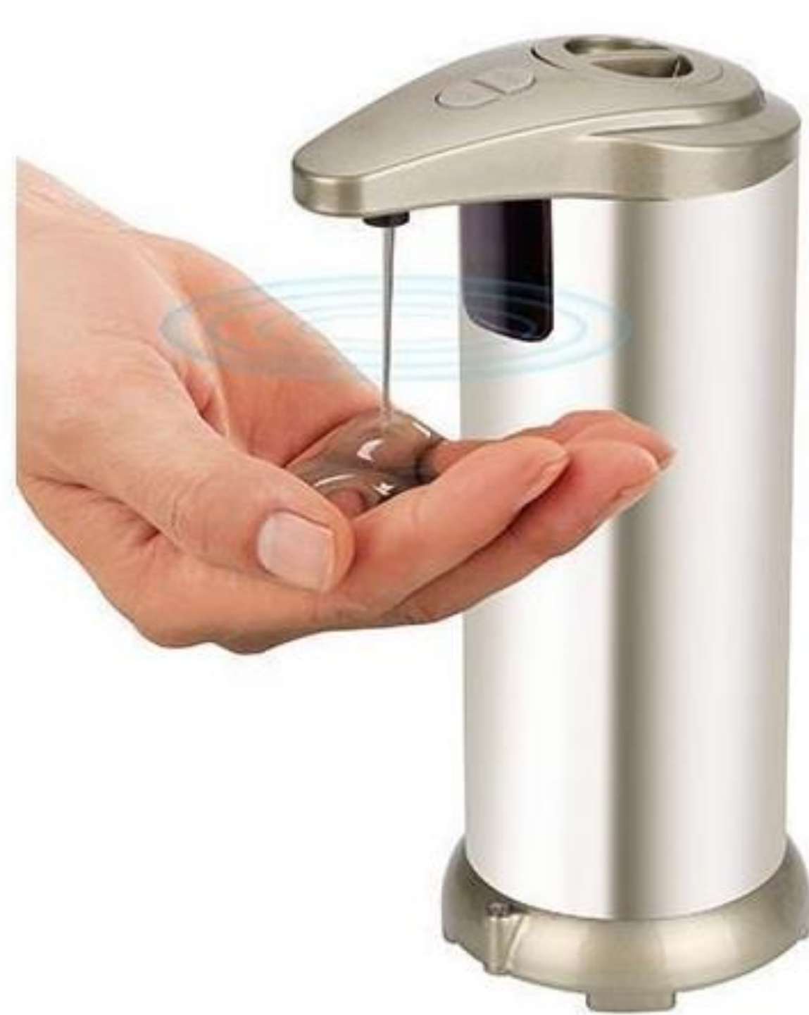
Automatic Soap Dispensers