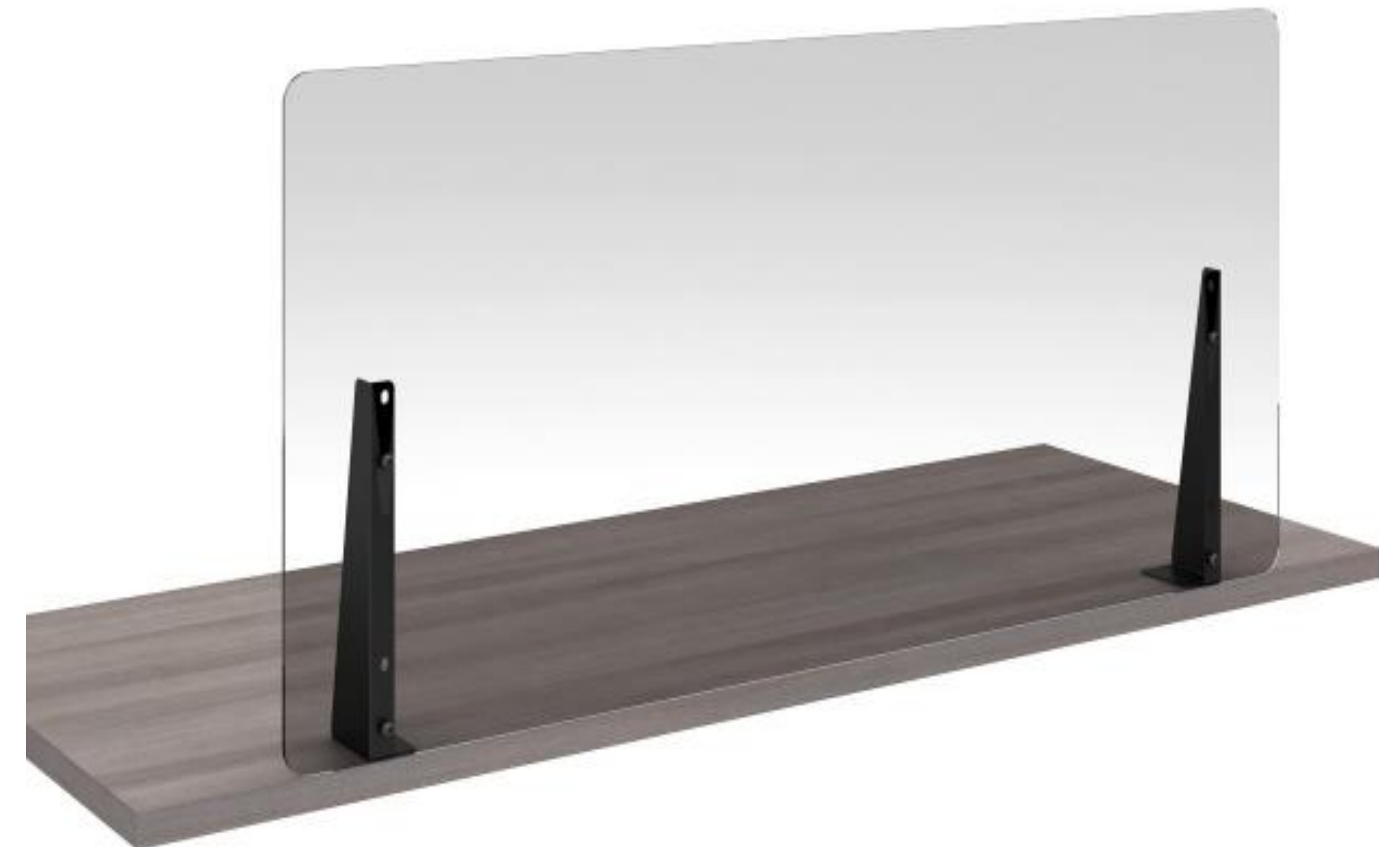
Sneeze Guard Screens