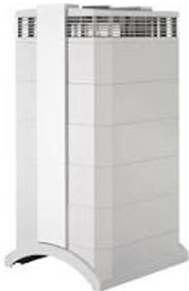
Upgraded Air Filtration