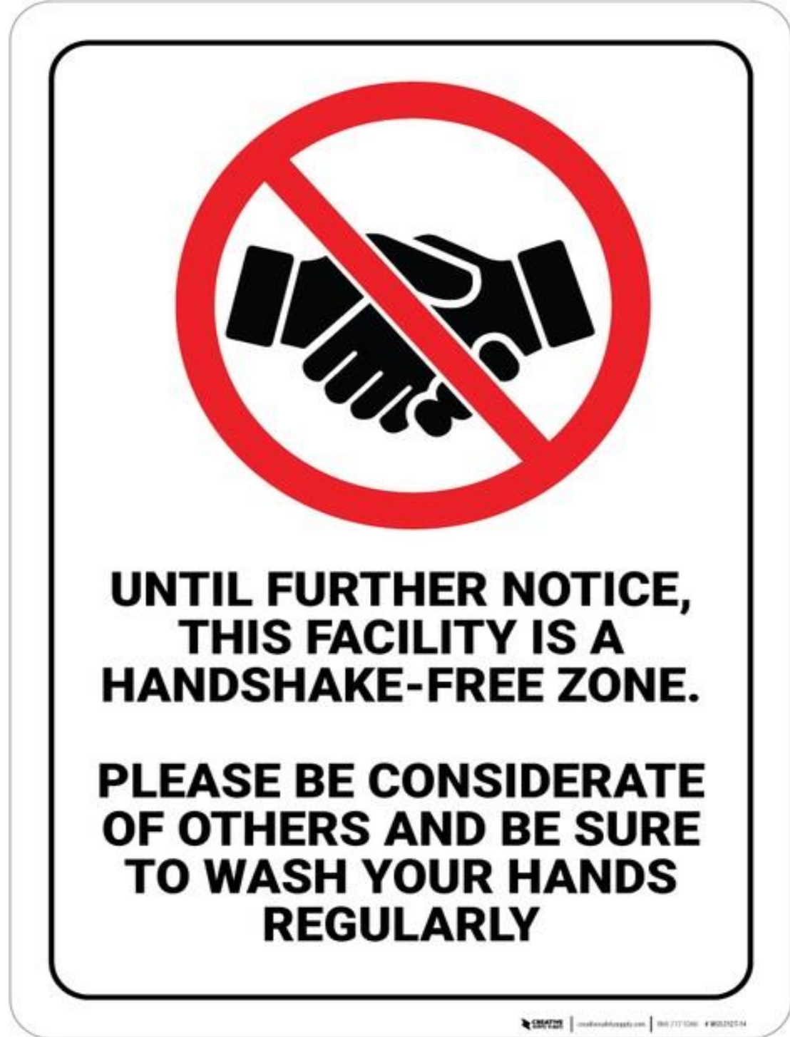
Company Policy Signage