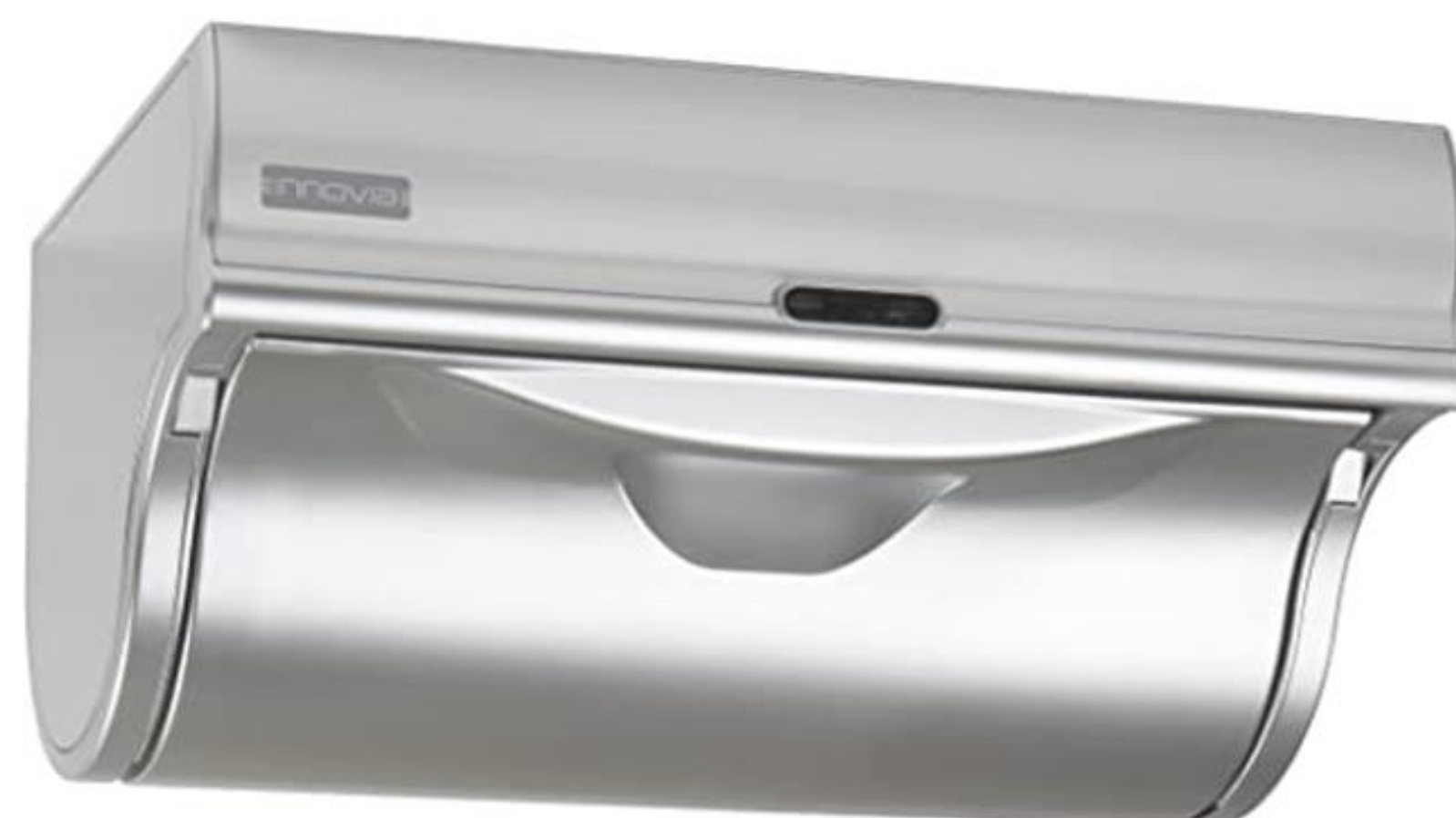
Automatic Paper Towel Dispensers