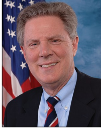
Hon. Frank Pallone 8th Congressional District