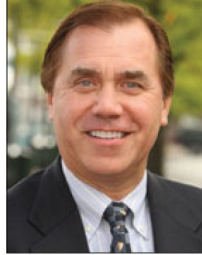
Assembly Speaker Craig Coughlin